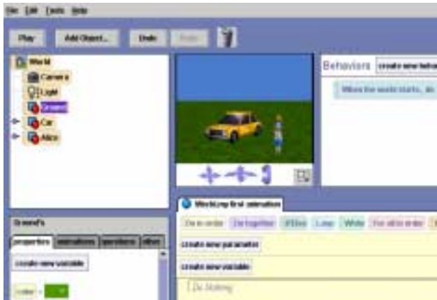
Figure 1. The Alice Interface

In this approach, we use Alice, a 3D interactive, animation, programming environment for building virtual worlds, designed for novices. The Alice system, developed by a research group at Carnegie Mellon under direction of one of the authors, is freely available at www.alice.org . A brief description of the interface is provided.