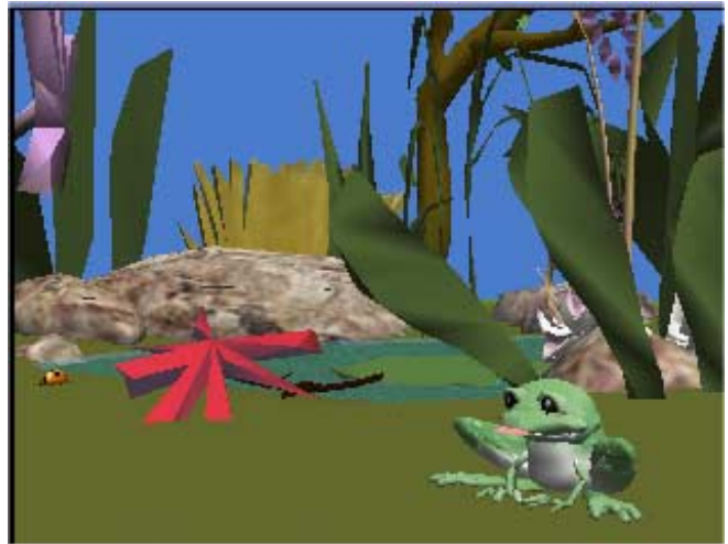
Figure 2. An initial scene in an Alice world

a brief example is discussed below to illustrate some of the principles. Interested readers may wish to read [4, 6, 7] for a more complete description. Figure 2 contains an initial scene that includes a frog (named kermit ), a beetle ( ladybug ), a flower ( redFlower ), and several other objects around a pond.