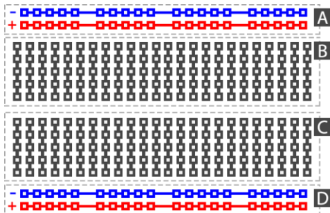
Figure 1: Breadboard connections.