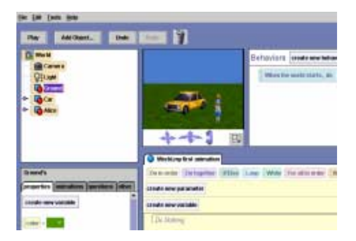
Figure 1. The Alice Interface

In this approach, we use Alice, a 3D interactive, animation, programming environment for building virtual worlds, designed for novices. The Alice system, developed by a research group at Carnegie Mellon under direction of one of the authors, is freely available at www.alice.org. A brief description of the interface is provided.