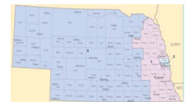
Figure 5: Current Congressional Redistricting Plan

Table I lists the total population of each cluster formed using all the methods listed before. For each of the district formed using all the methods listed above the margin of error (that is, the difference in the actual population of the cluster and the required population) is computed and listed in Table II. We can see that CPSC produces clusters/districts that fit the input criteria the best. In the experiment described above CPSC produces clusters that are spatially contiguous, compact, and conform to the other constraints presented to the