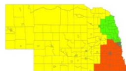
Figure 4: Results of CPSC

We then applied the CPSC algorithm on the Nebraska census tract dataset and obtained the three clusters shown in Figure 4. A visual inspection of the districts shows that the districts formed are spatially contiguous and compact. Finally, we also compare the current congressional districts as in Figure 5 with the districts formed using the above three algorithms.