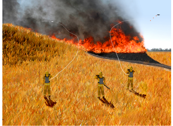
Fig. 1. Concept imagery depicting UAV operators at a prescribed fire, where bystanders work around the fire and may need state information.

Consider for example existing public-facing applications, such as Amazon Prime Air [1] or the Alphabet’s burrito delivery [2]. For such applications, the sUAS might be required to communicate not just with their control base, but also with the customers expecting a delivery, and bystanders that may not be fully aware of the intent of the vehicle. These other stakeholders may not have experience dealing with the sUAS but they will ultimately render their judgment about the application in part based on how the vehicle communicates with them. In other more specialized application contexts, like that of sUAS supporting fire management activities [3] as depicted in Fig. 1, communicating dangerous situations to fire personnel and accidental observers is critical. Alternately, these gestures could be used in agricultural applications of UAS, such as those in orchards [4] where most workers are unlikely to be trained on technologies unrelated to their tasks, but should be alerted to off-nominal operations.