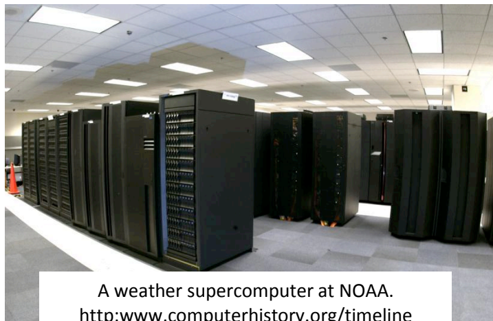
A weather supercomputer at NOAA. http://www.computerhistory.org/timeline

The benefits and uses of supercomputers are used in many different fields. For example, supercomputers can predict weather. "Every time you check the weather, you are actually seeing the output of a supercomputer."-video center. You can also use supercomputers for mathematical calculations, seismic activity (earthquakes), nuclear energy research, fluid dynamic calculations, submarine tracking, pattern matching, graph analysis, cryptology (the study of codes in which the key is unknown), data collection, and researching anything on the internet. All data goes through supercomputers and that's why you can find 62,600,000 results of the word "dog" in .04 seconds.